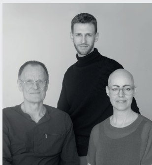
DESIGNER // HANS THYGE & CO.

And my main inspiration is neo-scandinavian design, influenced by the vibes of London and the humor of Amsterdam, often with elements of fusion, resulting in materials and functions being combined in new and original ways, while always striving for a pure and simple look.